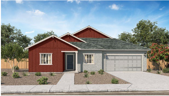
A - Farmhouse

2538 TISH TANG WAY REDDING, CA 96002 | DRHORTON.COM/SACRAMENTO