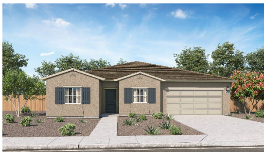
C - Mission